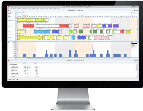
Interactive and embedded performance dashboard

This allows planners to instantly gauge the impact of change on schedule performance and take the necessary actions to ensure the schedule aligns more closely with planning objectives. Users can dynamically measure performance metrics, such as the cost and duration of events, like: